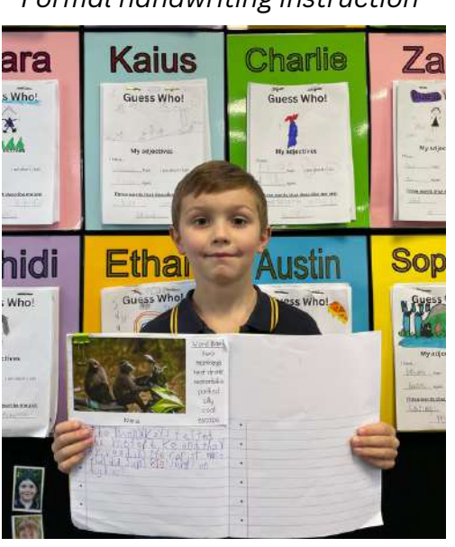
Celebrating and sharing writing