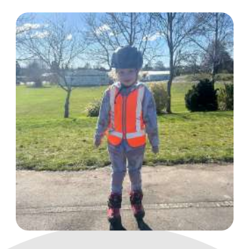
I love doing jumps.